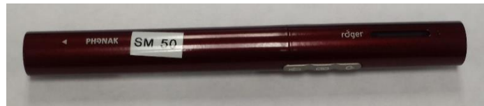
Can be placed in center of table during small group work

Remember to charge both microphones every day. You can leave them on the charger even when charged.