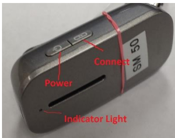
Power button and indicator light

To turn it on: Press and hold the power button (~2 sec). You will see a green light come on the front of the microphone. It will flash every few seconds to tell you it is on.