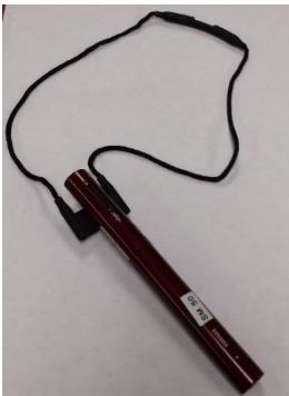
Teacher can wear on lanyard during direct instruction

Note: The Primary Microphone MUST be ON in order for the Secondary Microphone to work. It can be on MUTE, but it has to be on.