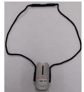
Best worn on lanyard

The lanyard has a magnetic clasp so it can be easily transferred to another teacher/speaker.