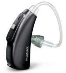
Roger Focus Receiver

The Roger Inspiro Transmitter sends the wearer's voice directly to the student's ear-level receiver, called a Roger Focus Receiver. The transmitter and receiver(s) must be used together for the system to function.