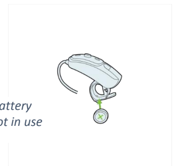
Open the battery door when not in use