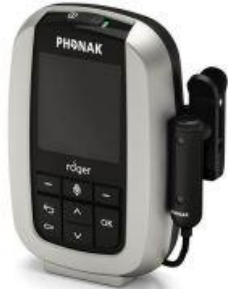
Roger Inspiro Transmitter

The Roger Inspiro Transmitter sends the wearer's voice directly to the student's ear-level receiver, called a Roger Focus Receiver. The transmitter and receiver(s) must be used together for the system to function.