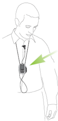
Around the neck using a lanyard