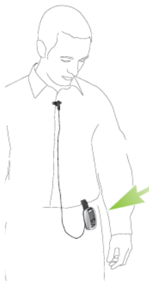
On the belt using a belt clip