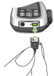
Charge the transmitter every day

*Remember to open the battery door when the device is not in use; this will help preserve battery life.*